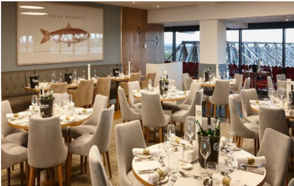
The Beautiful Game lounge Anfield