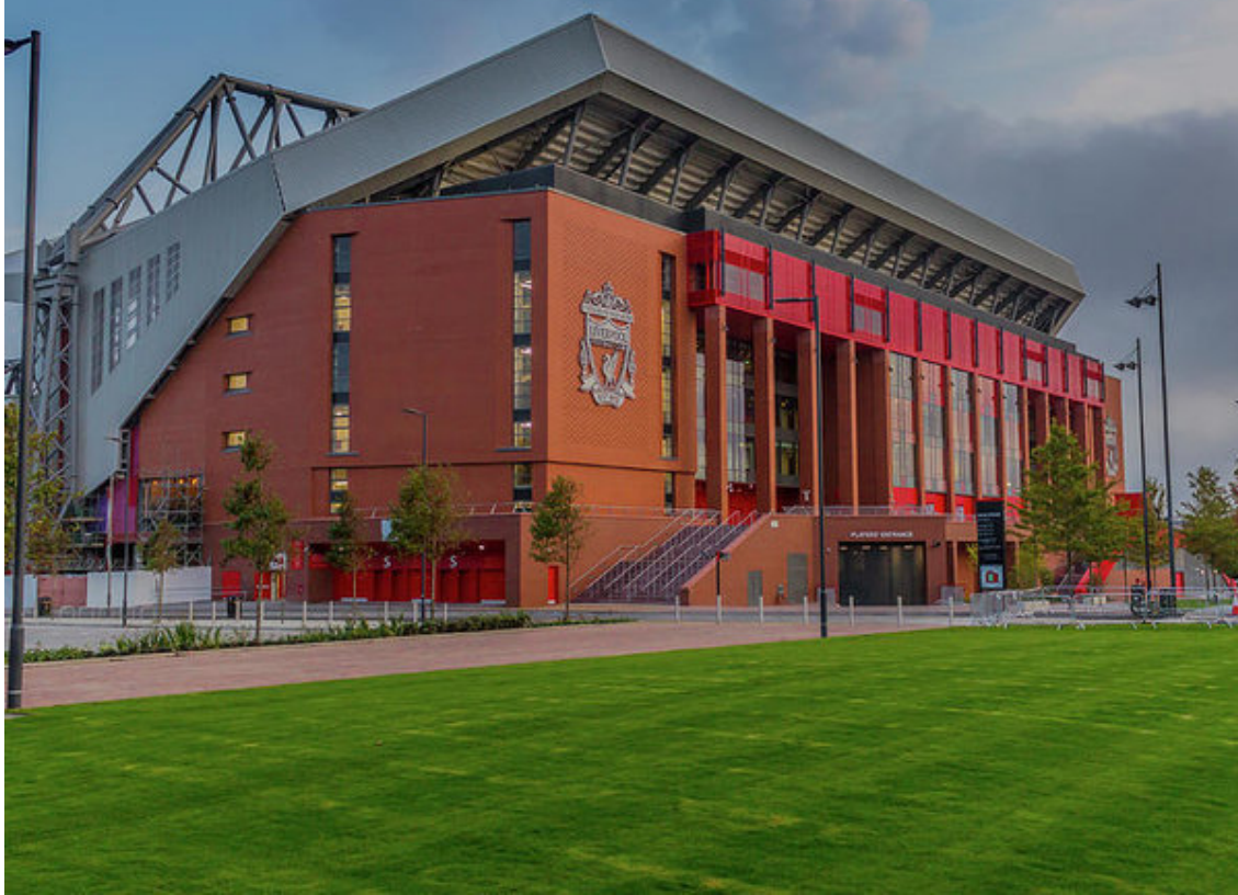
Main stand Anfield